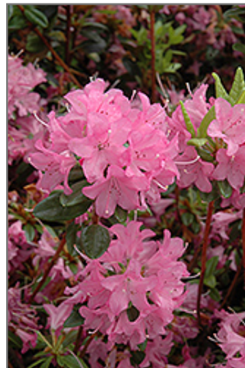
Hardijzer's Beauty Rhododendron flowers