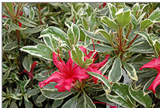
Girard's Variegated Gem Azalea flowers