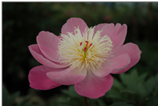
Edulis Superba Peony flowers