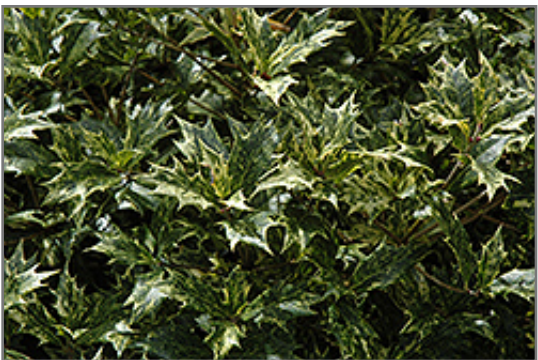
Variegated False Holly foliage