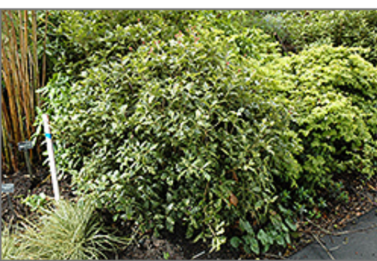
Variegated False Holly

This is a relatively low maintenance shrub, and is best pruned in late winter once the threat of extreme cold has passed. Deer don't particularly care for this plant and will usually leave it alone in favor of tastier treats. Gardeners should be aware of the following characteristic(s) that may warrant special consideration;