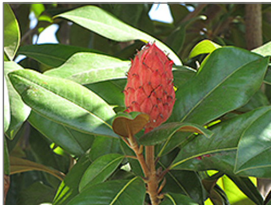
Southern Magnolia fruit

This tree does best in full sun to partial shade. It requires an evenly moist well-drained soil for optimal growth. It is not particular as to soil type, but has a definite preference for acidic soils. It is somewhat tolerant of urban pollution, and will benefit from being planted in a relatively sheltered location. Consider applying a thick mulch around the root zone in winter to protect it in exposed locations or colder microclimates. This species is native to parts of North America.