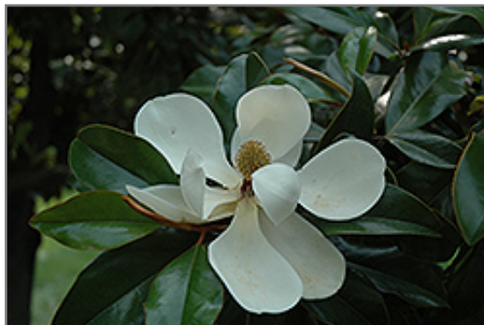
Southern Magnolia flowers

Southern Magnolia is an evergreen tree with a shapely oval form. Its relatively coarse texture can be used to stand it apart from other landscape plants with finer foliage.