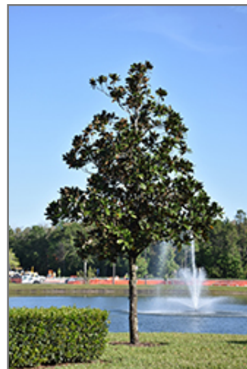
Southern Magnolia