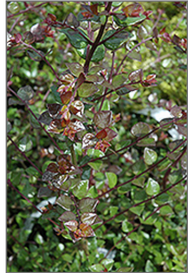
Red Tips Box Honeysuckle foliage

Red Tips Box Honeysuckle is recommended for the following landscape applications;