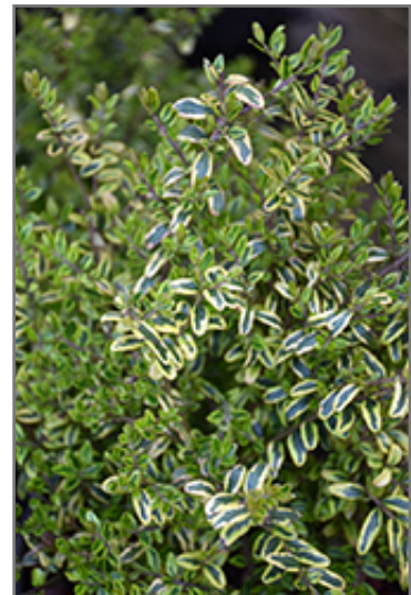
Lemon Beauty Box Honeysuckle foliage