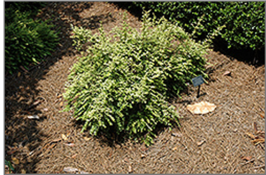
Lemon Beauty Box Honeysuckle