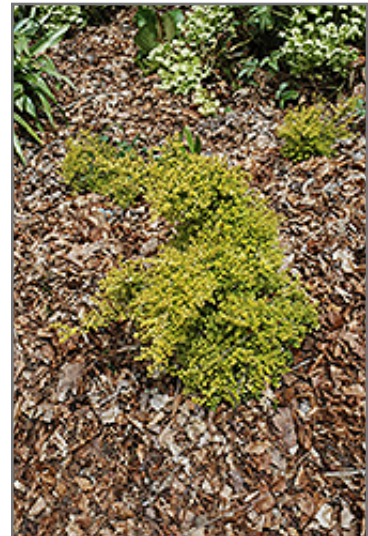
Baggesen's Gold Box Honeysuckle