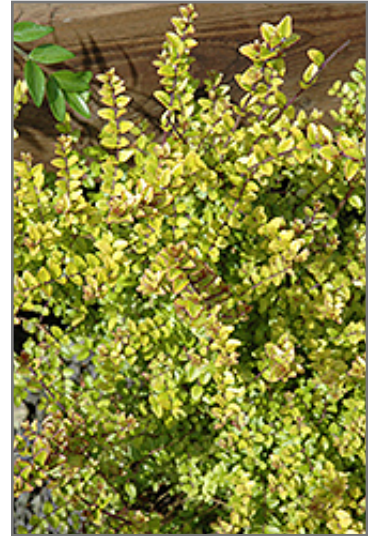
Baggesen's Gold Box Honeysuckle foliage