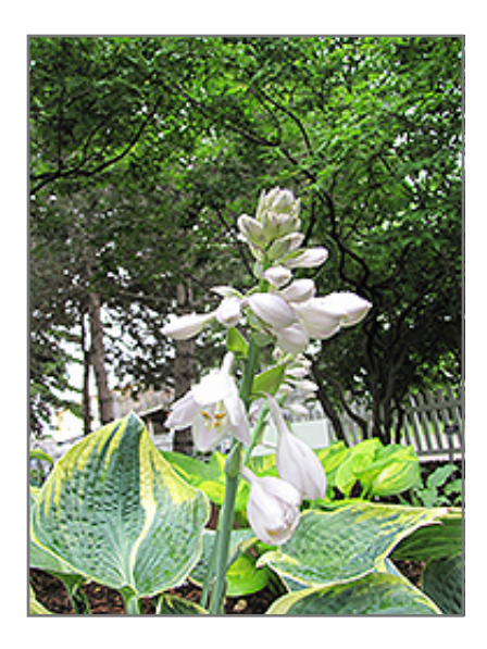
Sugar Daddy Hosta flowers