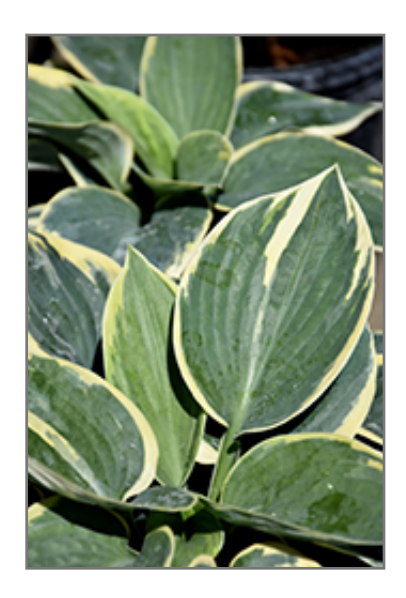
Sugar Daddy Hosta foliage

Sugar Daddy Hosta is recommended for the following landscape applications;