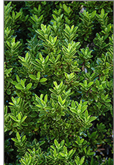
Boxleaf Euonymus foliage