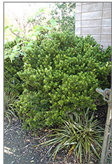
Boxleaf Euonymus