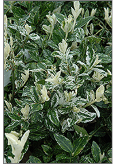
Harlequin Wintercreeper foliage