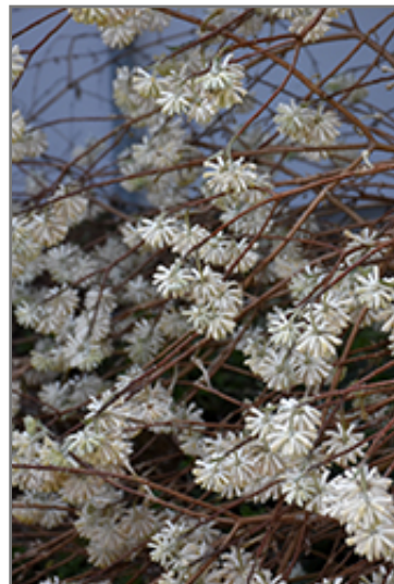
Oriental Paper Bush flowers