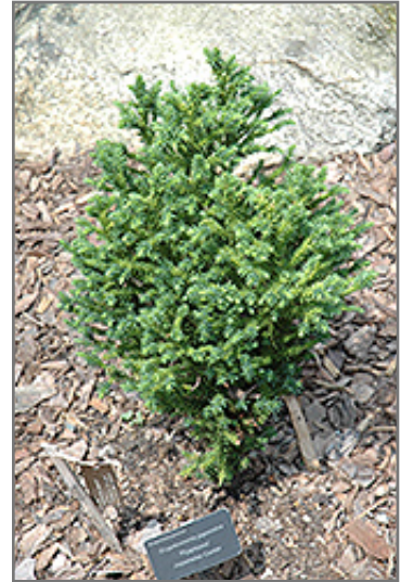
Pygmaea Japanese Cedar

Pygmaea Japanese Cedar will grow to be about 15 inches tall at maturity, with a spread of 18 inches. It tends to fill out right to the ground and therefore doesn't necessarily require facer plants in front. It grows at a slow rate, and under ideal conditions can be expected to live for 40 years or more.