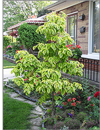
Cherokee Daybreak Flowering Dogwood