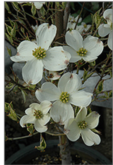
Cherokee Daybreak Flowering Dogwood flowers