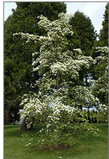
Eddie's White Wonder Flowering Dogwood in bloom