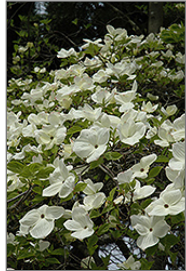
Eddie's White Wonder Flowering Dogwood flowers

Eddie's White Wonder Flowering Dogwood is recommended for the following landscape applications;