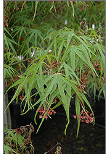
Ao Shime No Uchi Japanese Maple flowers