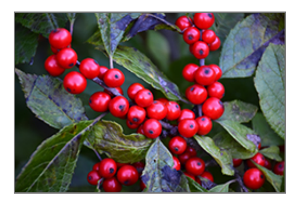
Berry Nice Winterberry fruit

An interesting and showy fall shrub known for its brilliant scarlet-red fruit; sheds leaves early in fall to reveal berries; spreads to form colonies, Jim Dandy is recommended as pollinator, great in masses and particularly wet sites, needs acidic soil