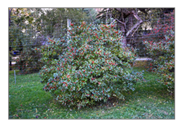
Berry Nice Winterberry fruit

Berry Nice Winterberry is recommended for the following landscape applications;