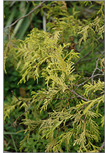
Weeping Golden Threadleaf Falsecypress foliage