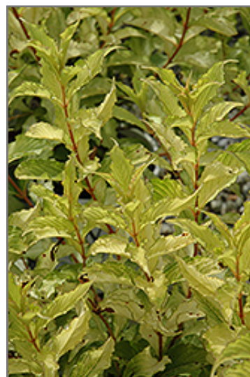
Ghost Weigela foliage