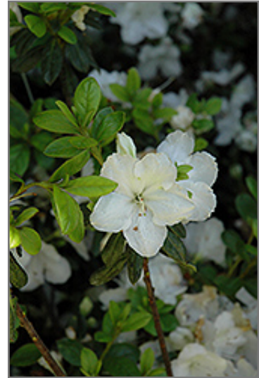
Pleasant White Azalea flowers

Pleasant White Azalea will grow to be about 4 feet tall at maturity, with a spread of 4 feet. It tends to be a little leggy, with a typical clearance of 1 foot from the ground. It grows at a slow rate, and under ideal conditions can be expected to live for 40 years or more.