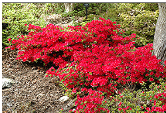
Hino Crimson Azalea in bloom