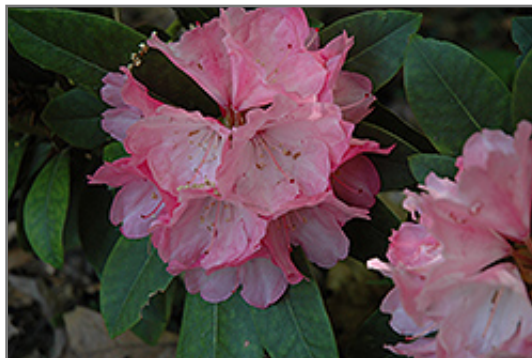
Hachmann's Belona Rhododendron flowers

Hachmann's Belona Rhododendron will grow to be about 5 feet tall at maturity, with a spread of 5 feet. It tends to be a little leggy, with a typical clearance of 1 foot from the ground, and is suitable for planting under power lines. It grows at a slow rate, and under ideal conditions can be expected to live for 40 years or more.