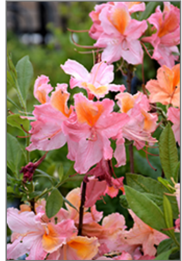
Mount St. Helens Azalea flowers

This beautiful hybrid is open and airy with buds that are coral red as they open; the blooms are pink and coral with a yellow blotch in a cluster; absolutely must have well-drained, highly acidic and organic soil