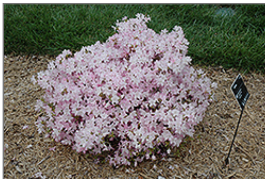
Bubblegum Rhododendron in bloom