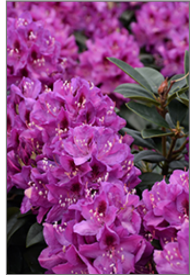
Anah Kruschke Rhododendron flowers

Anah Kruschke Rhododendron will grow to be about 5 feet tall at maturity, with a spread of 5 feet. It tends to be a little leggy, with a typical clearance of 1 foot from the ground, and is suitable for planting under power lines. It grows at a slow rate, and under ideal conditions can be expected to live for 40 years or more.