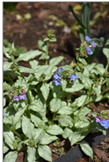
Moonshine Lungwort in bloom

Moonshine Lungwort is an herbaceous perennial with a mounded form. Its medium texture blends into the garden, but can always be balanced by a couple of finer or coarser plants for an effective composition.