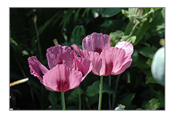
Patty's Plum Poppy flowers