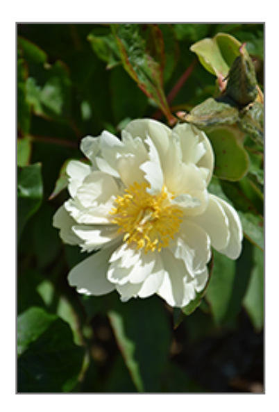
Claire de Lune Peony flowers