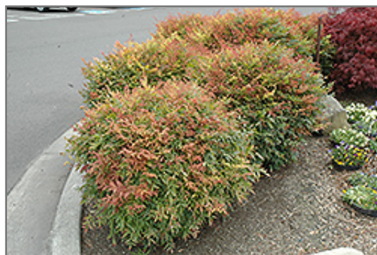
Sienna Sunrise Nandina