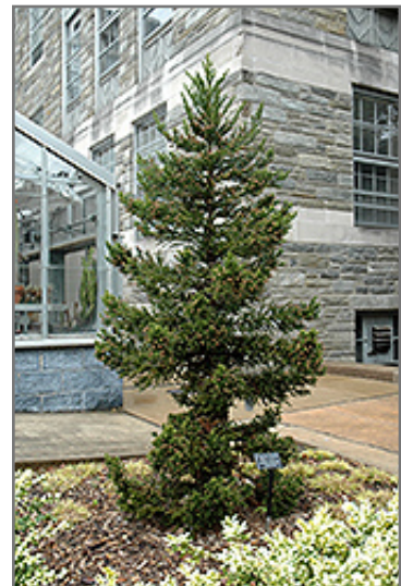
Black Dragon Japanese Cedar