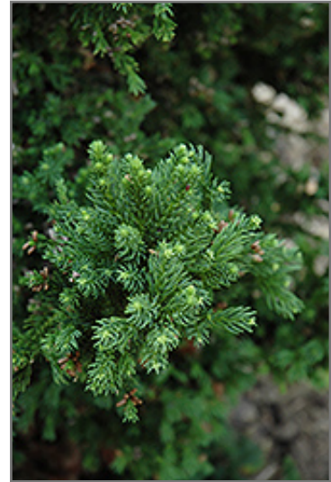
Black Dragon Japanese Cedar foliage