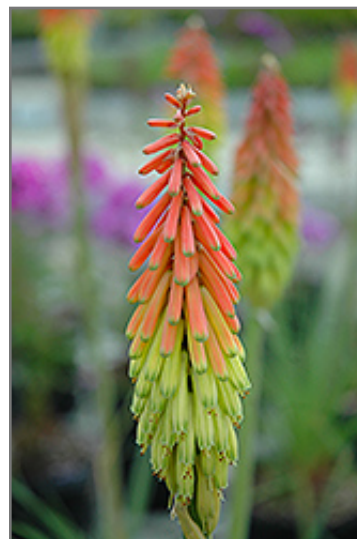
Traffic Lights Torchlily flowers