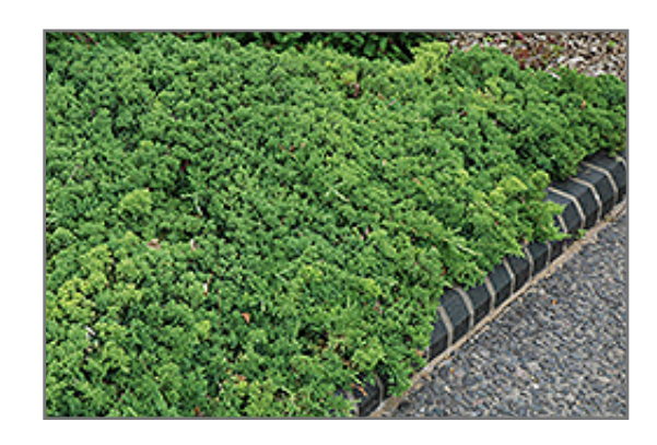
Green Mound Dwarf Japanese Juniper

This is a relatively low maintenance shrub, and is best pruned in late winter once the threat of extreme cold has passed. Deer don't particularly care for this plant and will usually leave it alone in favor of tastier treats. It has no significant negative characteristics.