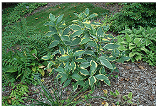
Lemon Wave Hydrangea