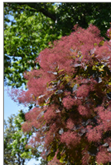
Grace Smokebush flowers