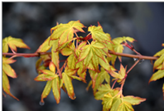
Ueno Homare Japanese Maple foliage

Ueno Homare Japanese Maple is recommended for the following landscape applications;