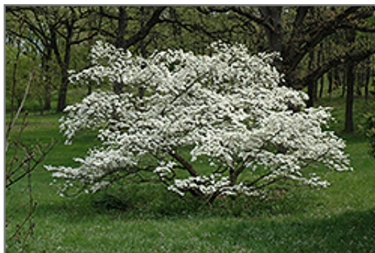
Cherokee Princess Flowering Dogwood in bloom