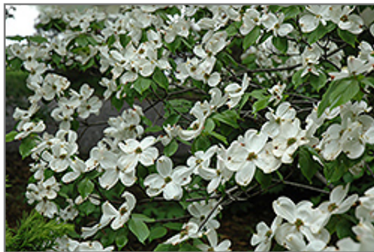
Cherokee Princess Flowering Dogwood flowers