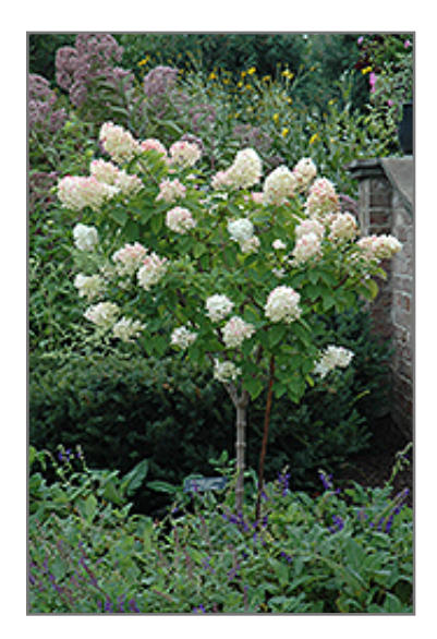
Limelight Hydrangea (tree form) in bloom

Limelight Hydrangea (tree form) will grow to be about 6 feet tall at maturity, with a spread of 7 feet. It tends to be a little leggy, with a typical clearance of 3 feet from the ground, and is suitable for planting under power lines. It grows at a medium rate, and under ideal conditions can be expected to live for 40 years or more.