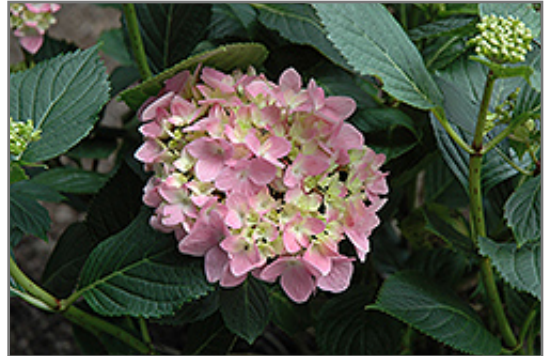
Shamrock Hydrangea flowers