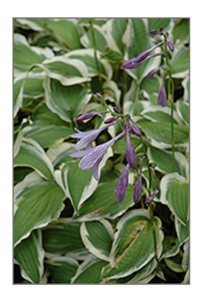
Ground Master Hosta flowers

A small to medium sized variety featuring mounds of dark green leaves with golden margins that fade to cream by summer; lilac-purple flowers appear on tall scapes in the summer months; adds color, contrast and texture to beds, borders and containers