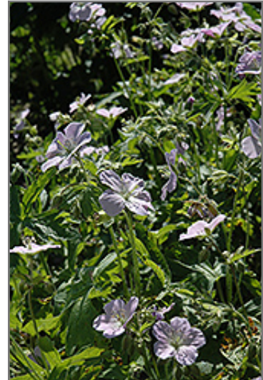
Chatto Wild Cranesbill flowers