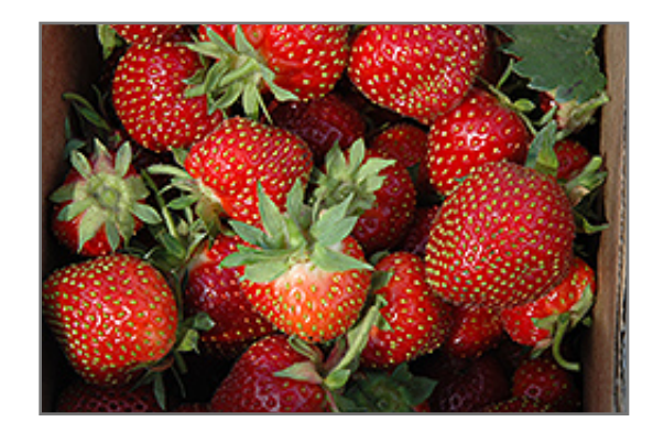
Allstar Strawberry fruit