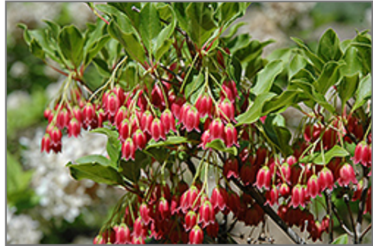
Showy Lanterns Enkianthus flowers

Showy Lanterns Enkianthus is recommended for the following landscape applications;