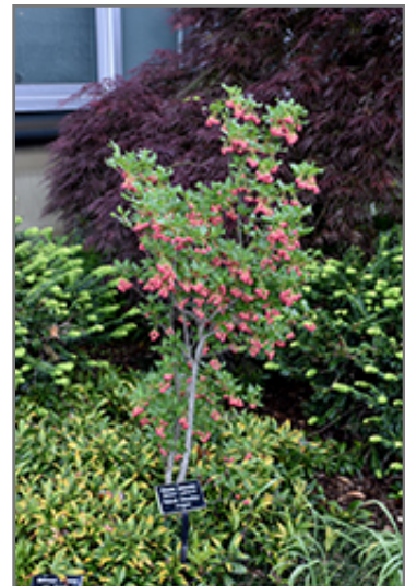
Showy Lanterns Enkianthus in bloom