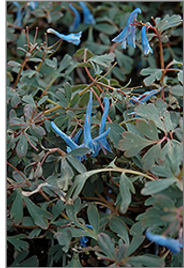
Blue Heron Corydalis flowers