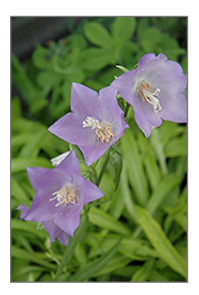
Blue Eyed Blonde Peachleaf Bellflower flowers

Blue Eyed Blonde Peachleaf Bellflower features showy spikes of blue bell-shaped flowers rising above the foliage from early to late summer. The flowers are excellent for cutting. Its attractive narrow leaves remain gold in colour throughout the season.