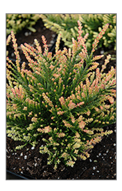
Flamingo Heather foliage

Flamingo Heather will grow to be about 12 inches tall at maturity, with a spread of 20 inches. It tends to fill out right to the ground and therefore doesn't necessarily require facer plants in front. It grows at a slow rate, and under ideal conditions can be expected to live for approximately 20 years.