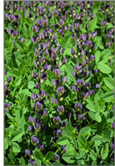
Twilite Prairieblues False Indigo flowers

This is a relatively low maintenance plant, and is best cleaned up in early spring before it resumes active growth for the season. It is a good choice for attracting bees and butterflies to your yard. It has no significant negative characteristics.