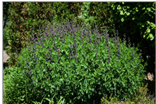
Twilite Prairieblues False Indigo in bloom