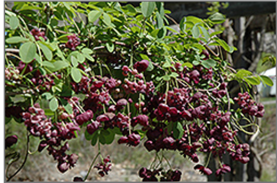
Purple Bouquet Fiveleaf Akebia flowers