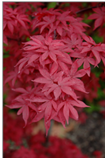
Twombly's Red Sentinel Japanese Maple foliage

Twombly's Red Sentinel Japanese Maple is recommended for the following landscape applications;