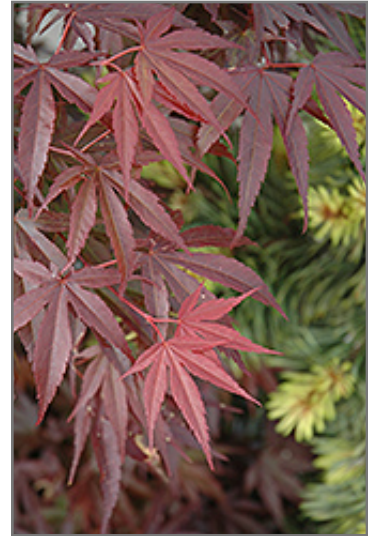
Skeeter's Broom Dwarf Japanese Maple foliage