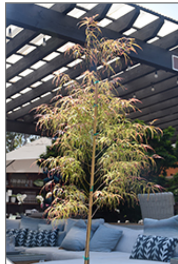
Koto No Ito Japanese Maple

Koto No Ito Japanese Maple is a fine choice for the yard, but it is also a good selection for planting in outdoor pots and containers. Its large size and upright habit of growth lend it for use as a solitary accent, or in a composition surrounded by smaller plants around the base and those that spill over the edges. It is even sizeable enough that it can be grown alone in a suitable container. Note that when grown in a container, it may not perform exactly as indicated on the tag - this is to be expected. Also note that when growing plants in outdoor containers and baskets, they may require more frequent waterings than they would in the yard or garden.