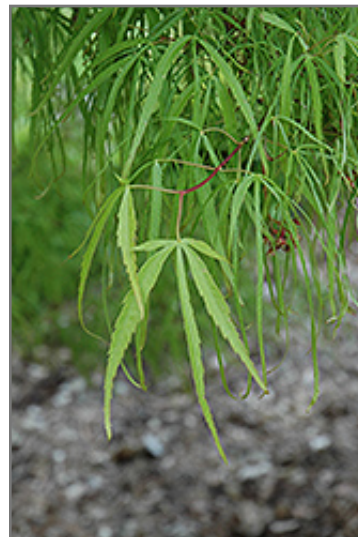
Koto No Ito Japanese Maple foliage

Koto No Ito Japanese Maple is a deciduous tree with an upright spreading habit of growth. It lends an extremely fine and delicate texture to the landscape composition which can make it a great accent feature on this basis alone.