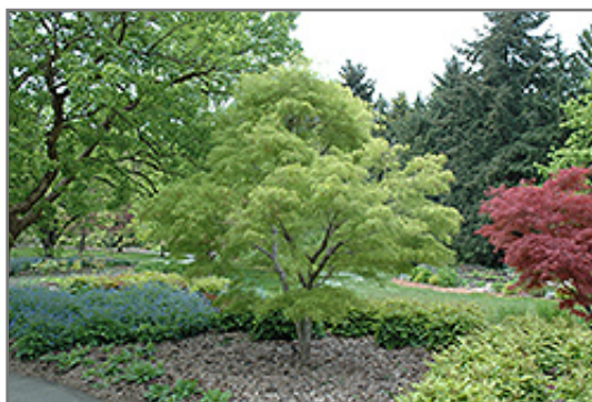
Koto No Ito Japanese Maple